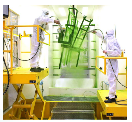
Flexible powder coating of flat and / or large workpieces.