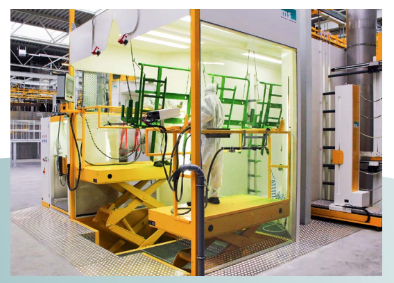
Manual coating area with integrated scissor lift tables.