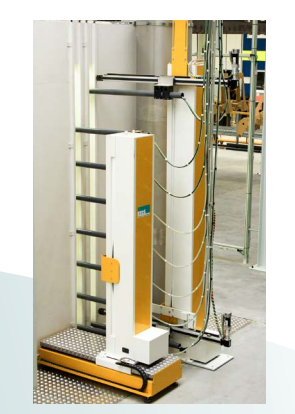
Automated coating with combination X-Y-Z axis controls.